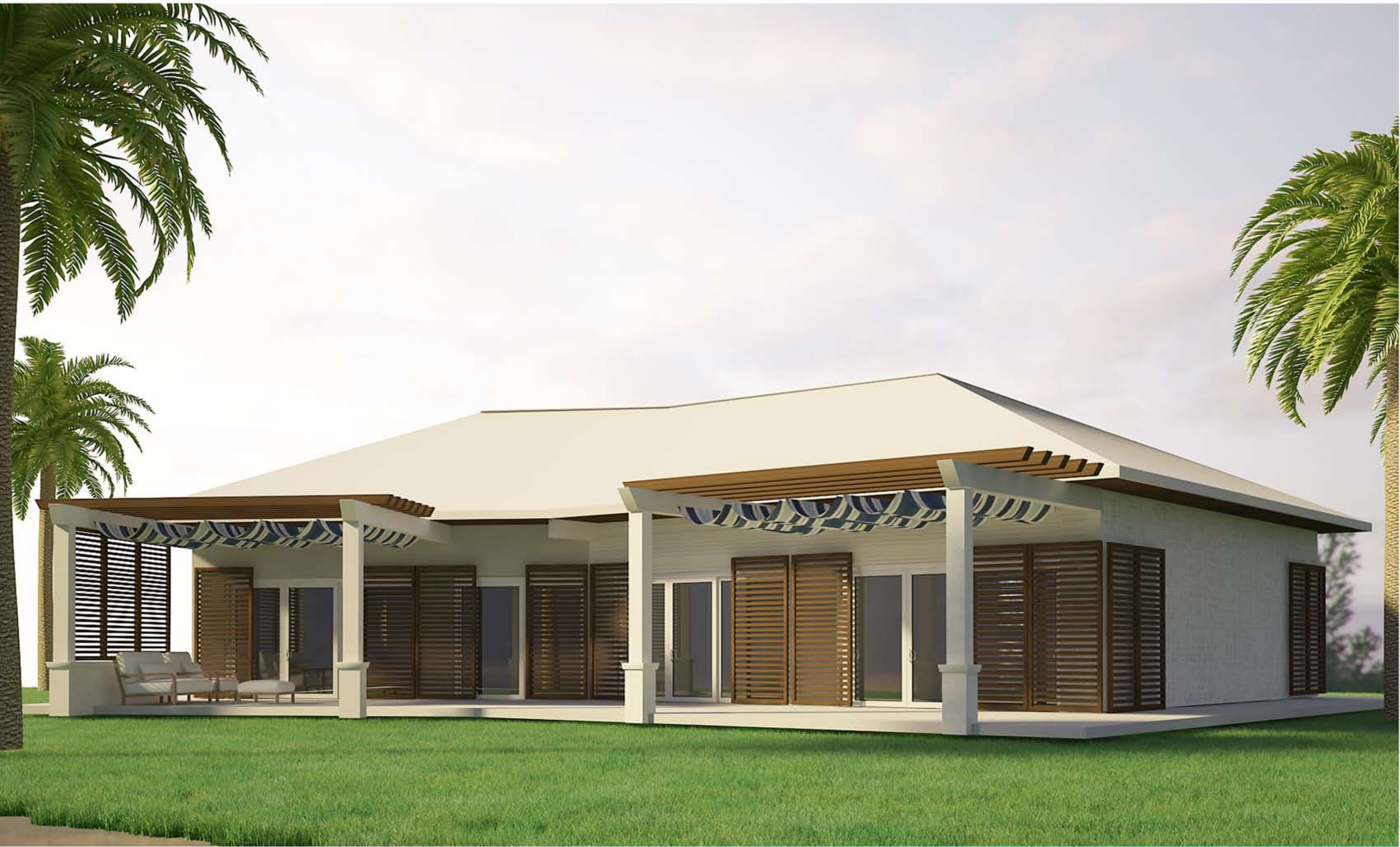
Spanish Wells exterior visualization - north side