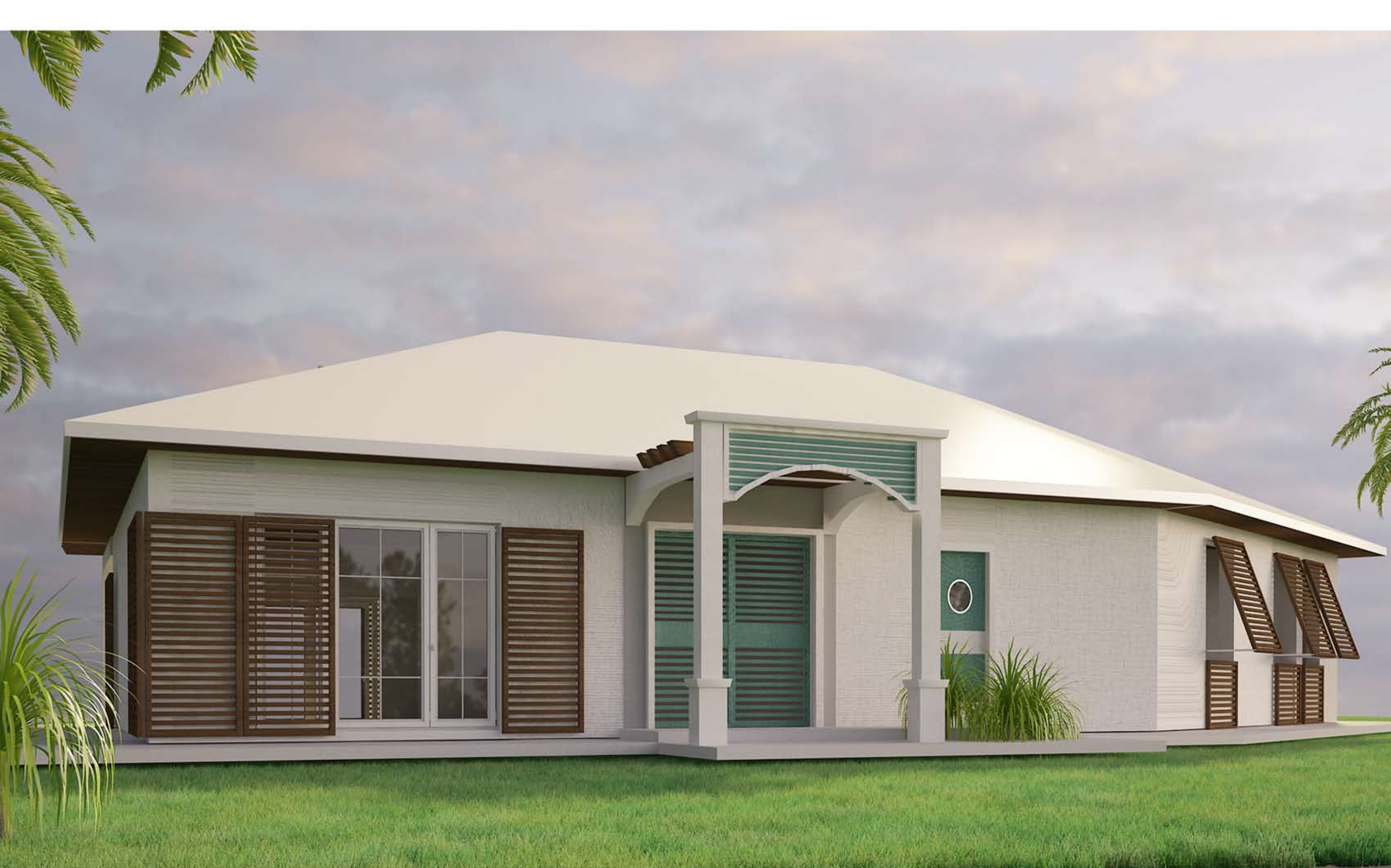
Spanish Wells exterior visualization - south side